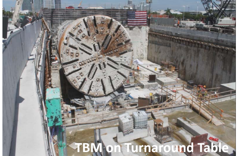
TBM on Turnaround Table