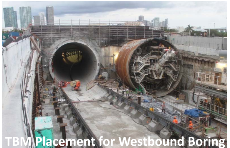
TBM Placement for Westbound Boring